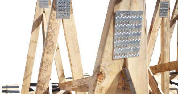
Mighty A-Frames™ #4000-MAF

Mighty A-Frames™ are handling structures made of heat-treated wood designed for shipping and storing stone slabs. Each frame can hold up to 7,000lbs worth of product. Standard measures are 11x5x5 feet. However, the Mighty A-Frames™ can be customized to fit your specific needs. The Mighty A-Frames™ is sent in a kit to be assembled by the customer for larger orders.